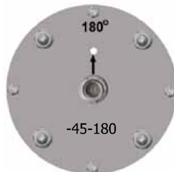
Bottom view on the antenna

Gain: 13 dBi Polarization: -45^\circ orthogonal Impedance: 50 Ohm Termination: 1 N-female Dimension: diameter 110 x height 550 mm Horizontal Beamwidth: 180^\circ (E-plane@-6dB) VSWR: 1.5 Vertical Beamwidth: 13^\circ (V-plane@-3dB) Band (GHz): 3.4-3.6 Power: max. 10 W Weight: 2.3 kg Antenna Enclosure: PVC-U (IP55 optionally)