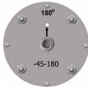
Bottom view on the antenna

Gain: 16 dBi Polarization: -45^\circ orthogonal Impedance: 50 Ohm Termination: 1 N-female Dimension: diameter 110 x height 1000 mm Horizontal Beamwidth: 180^\circ (E-plane@-6dB) VSWR: 1.5 Vertical Beamwidth: 11^\circ (V-plane@-3dB) Band (GHz): 3.4-3.6 Power: max. 10 W Weight: 2.7 kg Antenna Enclosure: PVC-U (IP55 optionally)