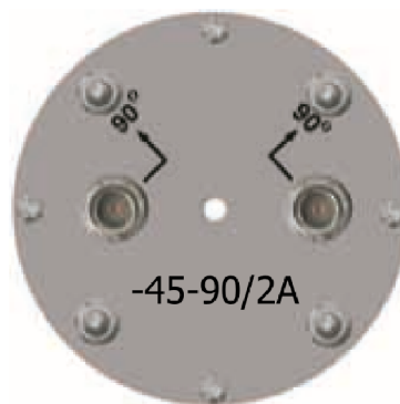
Bottom view on the antenna

Gain: 2x16 dBi Polarization: -45^\circ orthogonal Impedance: 2x 50 Ohm Termination: 2x N-female Dimension: diameter 110 x height 550 mm Horizontal Beamwidth: 2x 90^\circ (E-plane@-6dB) VSWR: 1.5 Vertical Beamwidth: 13^\circ (V-plane@-3dB) Band (GHz): 3.4-3.6 Power: max. 10 W Weight: 2.3 kg Antenna Enclosure: PVC-U (IP55 optionally)