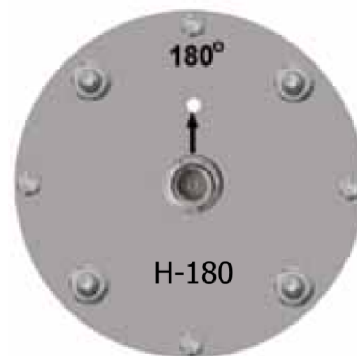
Bottom view on the antenna

Gain: 16 dBi Polarization: Horizontal Impedance: 50 Ohm Termination: 1 N-female Dimension: diameter 110 x height 1000 mm Horizontal Beamwidth: 180° (E-plane@-6dB) VSWR: 1.5 Vertical Beamwidth: 11° (V-plane@-3dB) Band (GHz): 3.4-3.6 Power: max. 10 W Weight: 2.7 kg Antenna Enclosure: PVC-U (IP55 optionally)