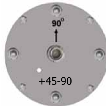
Bottom view on the antenna

Gain: 19 dBi Polarization: +45° orthogonal Impedance: 50 Ohm Termination: 1 N-female Dimension: diameter 110 x height 1000 mm Horizontal Beamwidth: 90° (E-plane@-6dB) VSWR: 1.5 Vertical Beamwidth: 11° (V-plane@-3dB) Band (GHz): 3.4-3.6 Power: max. 10 W Weight: 2.0 kg Antenna Enclosure: PVC-U (IP55 optionally)