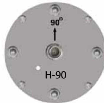
Bottom view on the antenna

Gain: 19 dBi Polarization: Horizontal Impedance: 50 Ohm Termination: 1 N-female Dimension: diameter 110 x height 1000 mm Horizontal Beamwidth: 90° (E-plane@-6dB) VSWR: 1.5 Vertical Beamwidth: 11° (V-plane@-3dB) Band (GHz): 3.4-3.6 Power: max. 10 W Weight: 2.0 kg Antenna Enclosure: PVC-U (IP55 optionally)