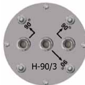
Bottom view on the antenna

Gain: 3x19 dBi Polarization: Horizontal Impedance: 3x 50 Ohm Termination: 3x N-female Dimension: diameter 110 x height 1000 mm Horizontal Beamwidth: 3x 90^\circ (E-plane@-6dB) VSWR: 1.5 Vertical Beamwidth: 11^\circ (V-plane@-3dB) Band (GHz): 3.4-3.6 Power: max. 10 W Weight: 3.0 kg Antenna Enclosure: PVC-U (IP55 optionally)