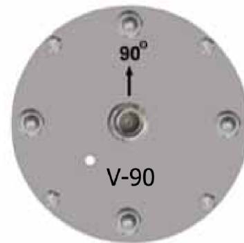
Bottom view on the antenna

Gain: 19 dBi Polarization: Vertical Impedance: 50 Ohm Termination: 1 N-female Dimension: diameter 110 x height 1000 mm Horizontal Beamwidth: 90° (E-plane@-6dB) VSWR: 1.5 Vertical Beamwidth: 11° (V-plane@-3dB) Band (GHz): 3.4-3.6 Power: max. 10 W Weight: 2.0 kg Antenna Enclosure: PVC-U (IP55 optionally)