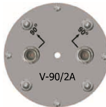
Bottom view on the antenna

Gain: 2x19 dBi Polarization: Vertical Impedance: 2x 50 Ohm Termination: 2x N-female Dimension: diameter 110 x height 1000 mm Horizontal Beamwidth: 2x 90^\circ (E-plane@-6dB) VSWR: 1.5 Vertical Beamwidth: 11^\circ (V-plane@-3dB) Band (GHz): 3.4-3.6 Power: max. 10 W Weight: 2.7 kg Antenna Enclosure: PVC-U (IP55 optionally)