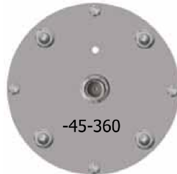
Bottom view on the antenna

Gain: 10 dBi Polarization: -45^\circ orthogonal polarization Impedance: 50 Ohm Termination: 1 N-female Dimension: diameter 110 x height 550 mm Horizontal Beamwidth: 360^\circ (E-plane@-6dB) VSWR: 1.5 Vertical Beamwidth: 13^\circ (V-plane@-3dB) Band (GHz): 3.4-3.6 Power: max. 10 W Weight: 2.5 kg Antenna Enclosure: PVC-U (IP55 optionally)