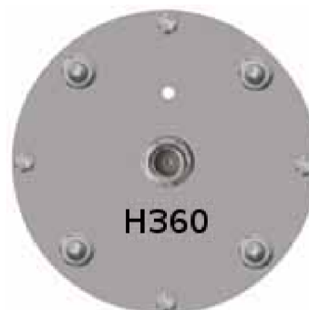
Bottom view on the antenna

Gain: 13 dBi Polarization: Horizontal Impedance: 50 Ohm Termination: N-female Dimension: diameter 110 x height 1000 mm Horizontal Beamwidth: 360° (E-plane@-6dB) VSWR: 1.5 Vertical Beamwidth: 11° (V-plane@-3dB) Band (GHz): 3.4-3.6 Power: max. 10 W Weight: 3.2 kg Antenna Enclosure: PVC-U (IP55 optionally)